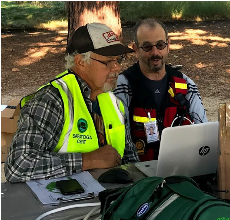
Fish shows a new participant how to use Outpost.

Each new participant was coached by an experienced operator, using a manual we had developed in a “Packet Lite” class earlier in the year. The coaches guided participants through the process of launching outpost, configuring the station, connecting to a Bulletin Board, and passing some simple messages. It took about 50 minutes and each student left with a personal copy of the manual.